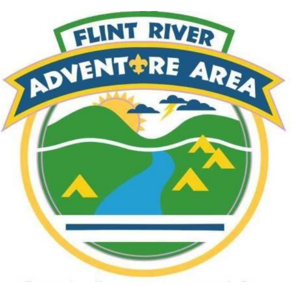
Call us today to make your reservation for Winter Camp!