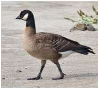
Imposter - Cackling Geese

Advance (Reservations Requested) Double knot Online Registration at http://www.flintrivercouncil.org