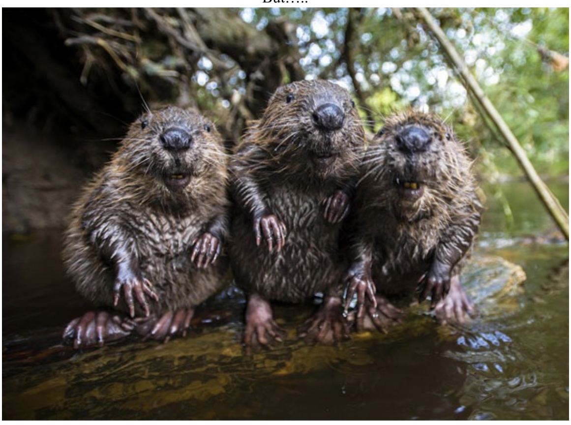
We are already at Thunder