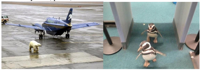
Planes the only way penguins will fly to the Klondike.