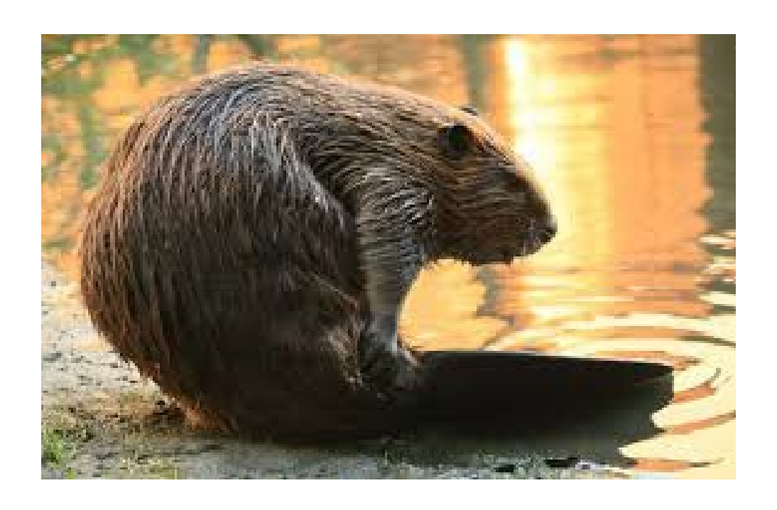
2021 Leaders Guide