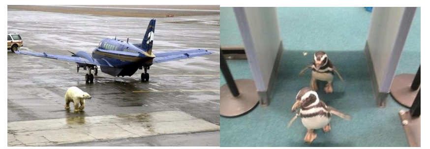
Planes the only way penguins will fly to the Klondike